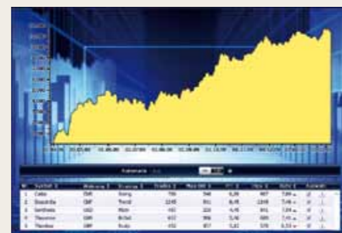
Completely automated exchange trading around the clock