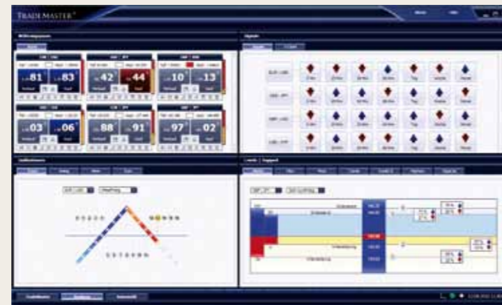
Newest analytical methods and tools for targeted, successful trading.

of the art programming, system redundancies to secure trades, redundant server solutions and of course specially encrypted data transmission systems are all part of it. It thus guarantees maximum transaction security. The integrated two-way order technology is based on various Api Connections and provides additional support using the standard banking FIX protocol. TradeMaster® makes it theoretically possible to carry out 170,000 trades every second!