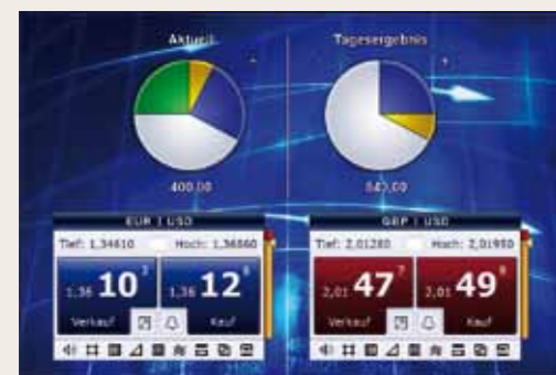
Fast, targeted trading

TRADEMASTER® IS REVOLUTIONIZING AND REDEFINING EXCHANGE TRADING.